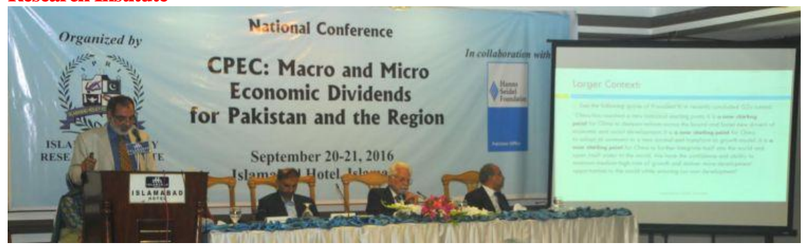
by Zamir Asadi,

"Pakistan's economy is expected to achieve 4.7% GDP growth in 2016" - Islamabad Policy Research Institute