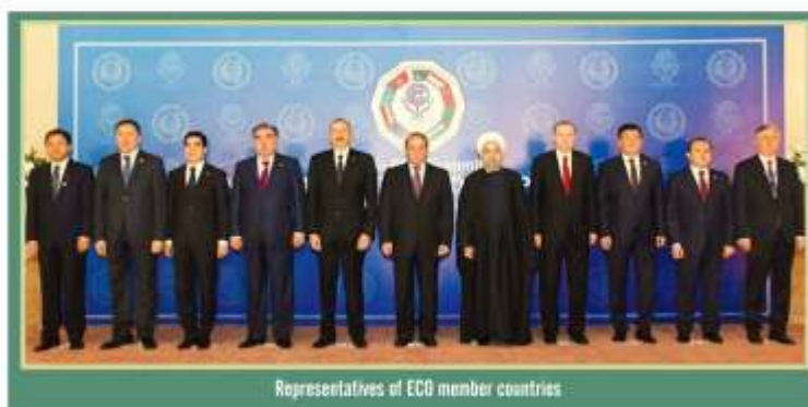
Representatives of ECO member countries

Resolution (A/RES/71/222) on International Decade for Action "Water for Sustainable Development" 2018-2028, adopted on December 21, 2016 thereby, instructing the relevant authorities as well as the ECO Secretariat to consider this issue in the framework of the activities and projects of the Organization.