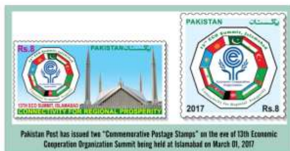
Pakistan Post has issued two "Commemorative Postage Stamps" on the eve of 13th Economic Cooperation Organization Summit being held at Islamabad on March 01, 2017

Moreover, there were two major developments during the Summit. First, the China-Pakistan Economic Corridor (CPEC) is considered a project with enough potential to connect Central Asia, Iran and eventually all the ECO member states together. More so, such maneuvering in the ECO region, if implemented as envisaged, can help create a web of such economic and trade connections. Second, the success of ECO Summit in the backdrop of cancellation of SAARC summit has negated the propaganda regarding Pakistan's isolation in the region. Rather, the summit brought ECO as a strong diplomatic front for Pakistan to grasp maximum support of the Muslim world. Pakistan must now ensure that the infrastructure and connectivity projects that it has undertaken are completed on time to meet the goals of this ECO conference. Provided a strong commitment and dedicated effort, this bloc can become a cohesive unit.