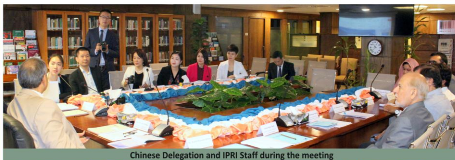
Chinese Delegation and IPRI Staff during the meeting