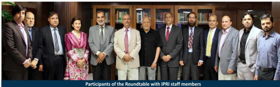
Participants of the Roundtable with IPRI staff members

One-Day Roundtable on “Violations of Rights of Religious Minorities (Muslims and Sikhs) in India” was organized by the Islamabad Policy Research Institute (IPRI) on July 12, 2017 at IPRI Conference Hall, Islamabad. The roundtable focused on the following main themes: