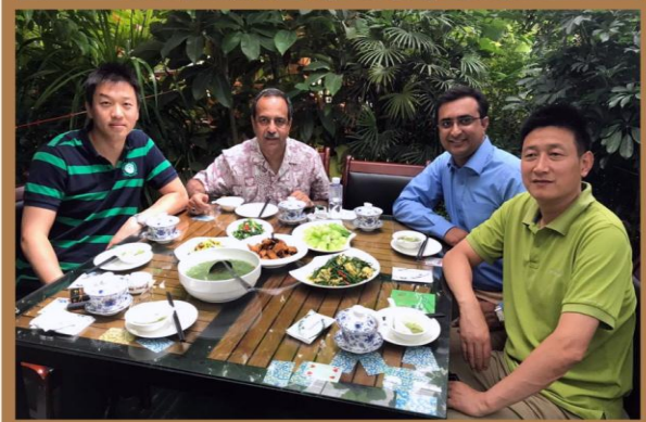
IPRI Scholars with members of Gansu Association for International Friendly Cooperation (GAIFC)