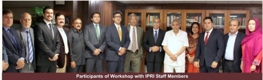
Participants of Workshop with IPRI Staff Members

Welcoming the distinguished speakers and discussants, Ambassador (R) Abdul Basit, President IPRI, elaborated on the theme of the workshop. He said the deliberations should not just enhance our understanding of the issue, but also help us reach a set of implementable policy recommendations for a peaceful and amicable resolution of the dispute. While the international community by and large remains indifferent to the human rights violations in Indian Occupied Kashmir (IOK), the mainland India is also largely nonchalant. The Indian establishment has been trying to portray the legitimate struggle of Kashmiris for their right to self-determination as terrorism.