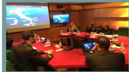
IPRI delegation at Italian Naval Headquarters during the roundtable