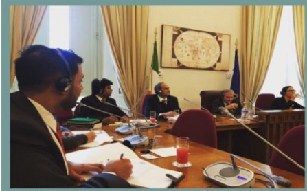
IPRI delegation during the meeting with Chairman Foreign Relations Committee, Italy