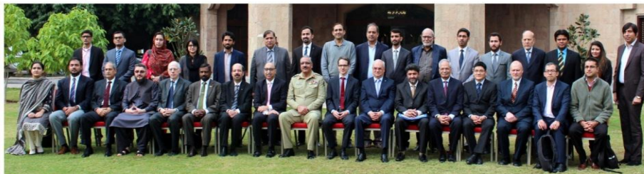
Conference Speakers with the Chief Guest, General Zubair Mahmood Hayat, NI(M), Chairman Joint Chiefs of Staff Committee (CJCS), Joint Staff Headquarters and Ambassador (R) Abdul Basit, President IPRI

The Islamabad Policy Research Institute (IPRI) in collaboration with the Hanns Seidel Foundation (HSF), Islamabad organized a two-day International Conference on "Regional Dynamics and Strategic Concerns in South Asia" in Islamabad on November 14-15, 2017. Delegates from Afghanistan, China, Germany, Nepal, Pakistan, Russia, Sri Lanka, US and the Shanghai Cooperation Organization (SCO) Secretariat participated in the conference. General Zubair Mahmood Hayat, NI(M),