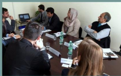
IPRI delegation with Centro Studi Internazionali (Ce.S.I.) scholars during the roundtable

international security and political stability of interest to respective countries.