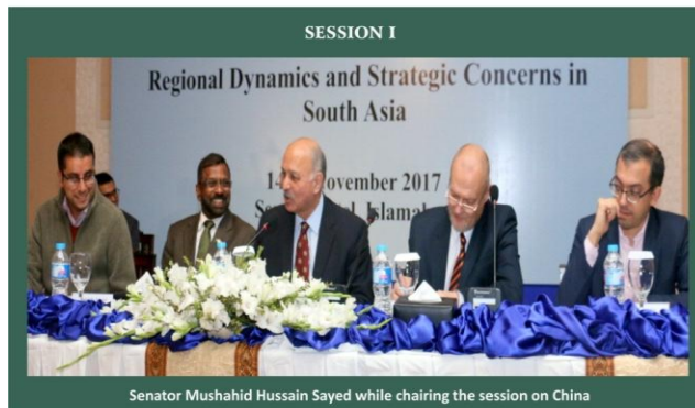
Senator Mushahid Hussain Sayed while chairing the session on China

Analyzing Russia's shift in policy, it was indicated that Russia has tilted towards Pakistan and the latter needs to capitalize on this