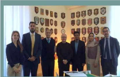
IPRI delegation with Centro Studi Internazionali (Ce.S.I.) scholars, Italy