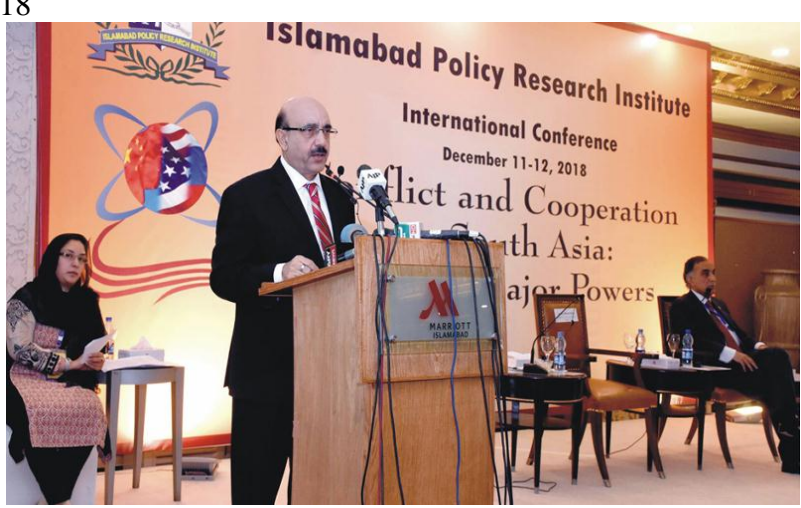
BRI offers vision of economic development Staff Report

Apart from the traditional security threats, the South Asian countries face multiple common challenges in the realm of non-traditional security and it is imperative that regional cooperation be sought to address such collective concerns like rising poverty, food insecurity, water shortages, illicit trafficking, poor human development indices etc., in the domain of social sector and human resource development, said speakers from Pakistan, China, Russia and the US speaking on the final day of the international conference 'Conflict and Cooperation in South Asia: Role of Major Powers' organised by the Islamabad Policy Research Institute, here in Islamabad on Wednesday.