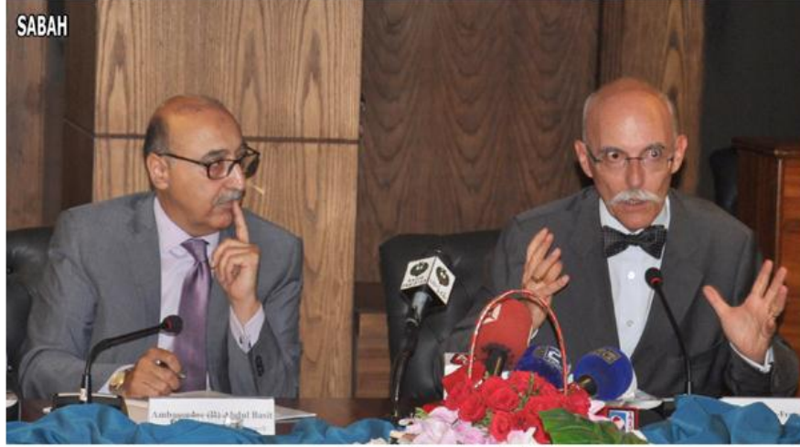
اسلام آباد: پاکستان میں یورپی یونین کے سفیر جین فرانکوئس کوئین اسلام آباد پالیسی ریسرچ انسٹی ٹیوٹ کے زیر اہتمام یورپی یونین پاکستان کے تعلقات چیٹلنجر اور موائے کے عنوان پر لیچر دے رہے ہیں جبکہ سابق سفارتکار اور اسلام آباد پالیسی ریسرچ انسٹی ٹیوٹ کے صدر عبدالباسط بھی موجود ہیں