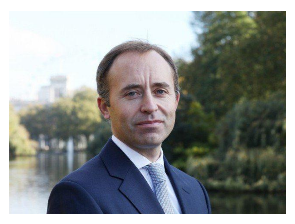
A file photo of British High Commissioner Thomas Drew.

ISLAMABAD: The British High Commissioner to Pakistan Thomas Drew has said the United Kingdom is ready to help Pakistan come out of the grey list of the Financial Action Task Force (FATF), an international body that seeks to curb terror financing.