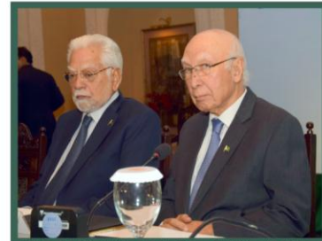
Mr. Sartaj Aziz, Advisor to the Prime Minister of Pakistan for Foreign Affairs, inaugurated the conference as the Chief Guest