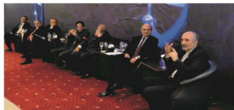
President IPRI moderating session at SASSI's 'Nuclearization of the Indian Ocean' conference